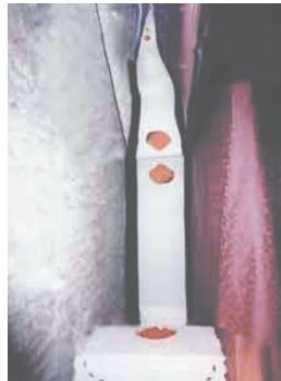
ginger andro and chuck glicksman