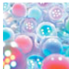
iColor Flex SLX