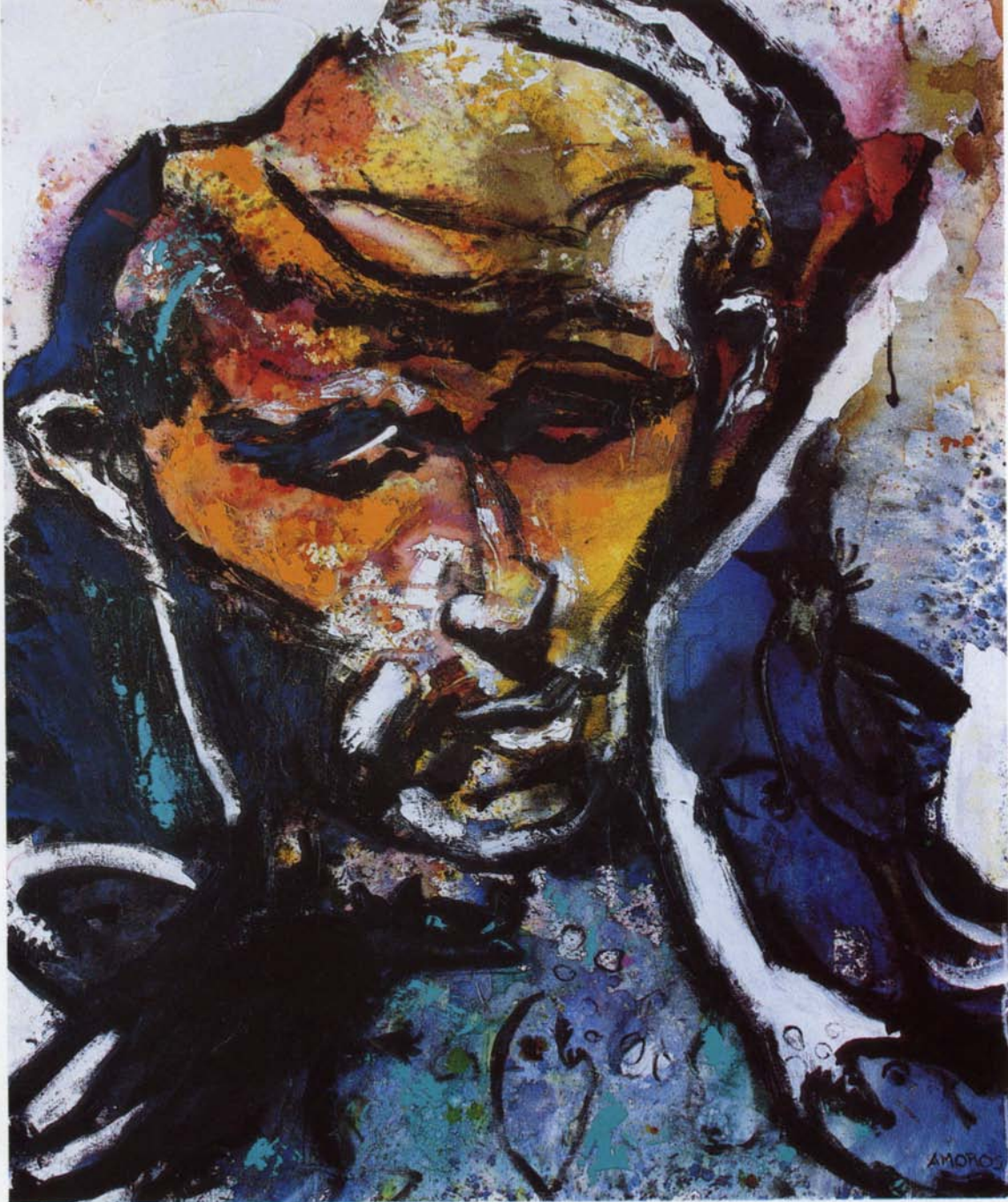
Mr. Incognito 50 x 42 inch. Mr. Incognito 127 x 106 cmt.

Acrylic on Canvas 1990 Acrilico en Tela 1990