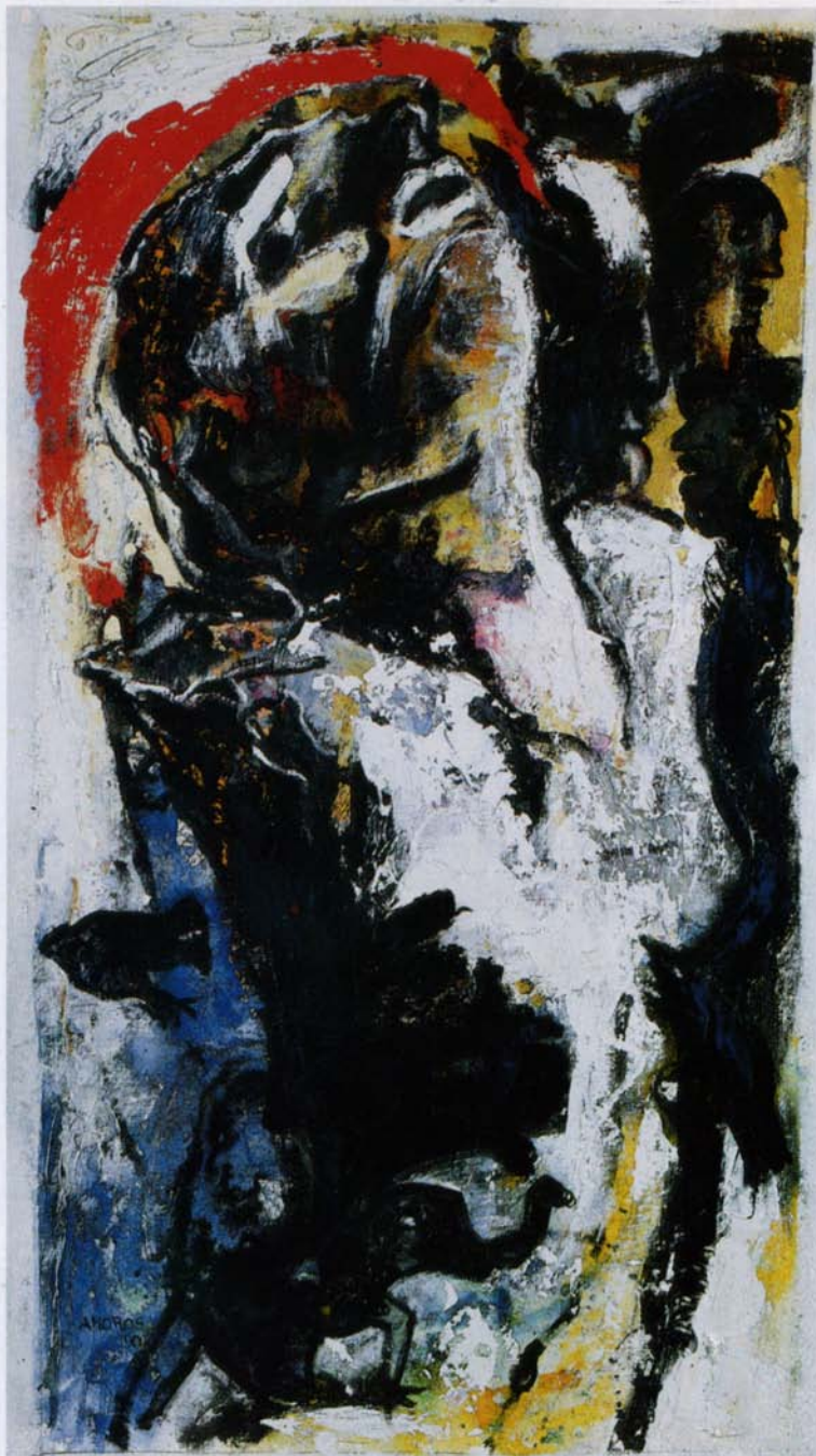
AGONY # 1 26 1/2 x 49 1/2 inch. AGONIA # 1 67 x 125.8

Acrylic on Canvas 1990 Acrílico en Tela 1990