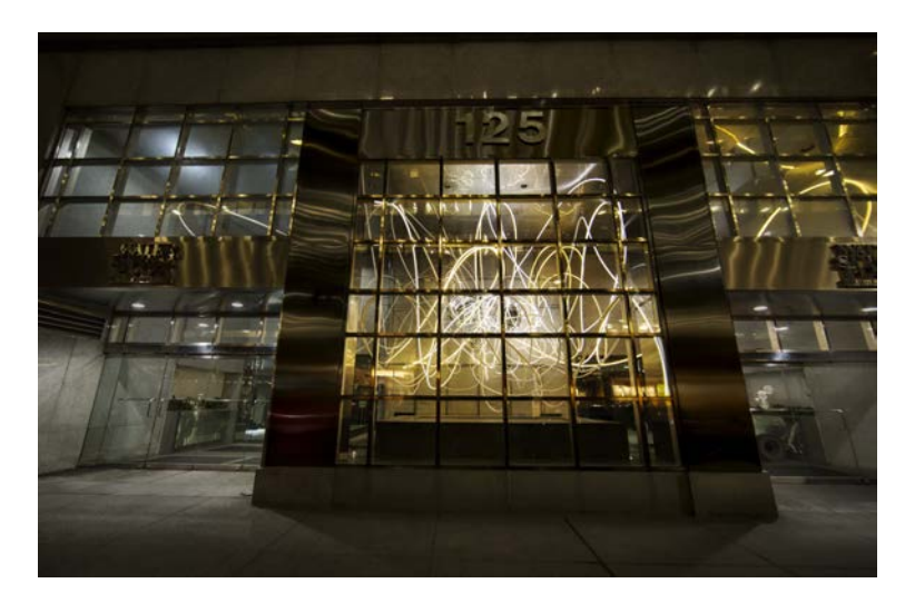
Breathless Maiden Lane, New York, NY, 2014

Installation documentations - Video and photographs