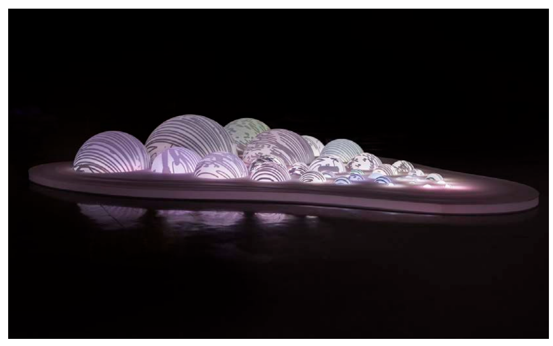
Light Between the Islands #2, 2013 LEDs, diffusive material, custom lighting sequence, electrical hardware 6' 7" x 9' 6" x 1"