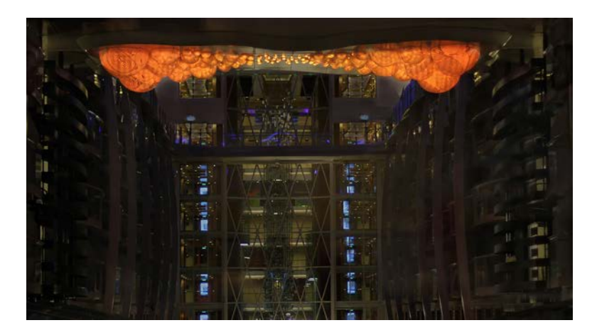
Racimo, Turku, Finland, 2010

Installation documentations - Video and photographs